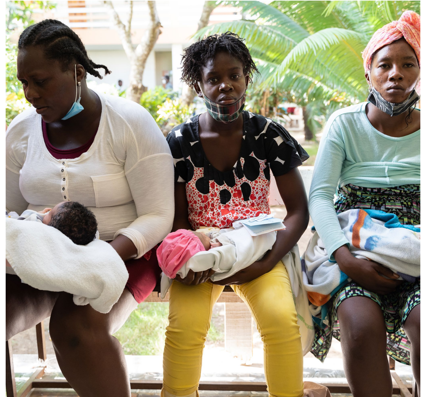
Three patients wait for appointments with their newborn babies

Our doors are always open, even amid natural disasters, political instability, and a global pandemic. No one is ever turned away because they cannot pay. Providing care is our only priority —for every patient, every day.